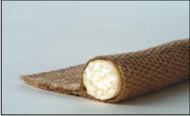
Maxsil® Tex Tadpole Seal Style MTS-30-MRB

Maxsil® Tex Tadpole Seals are manufactured from our continuous filament amorphous silica fiber. The yarn is texturized from filament silica fiber along with a high temperature finish added for excellent strength and abrasion resistance. Significantly more durable at high temperatures than standard leached silica fabrics. A replacement for Ceramic Fiber door seals.