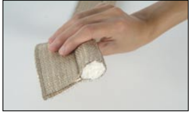
Maxsil® Tex Tadpole Seal Style MTS-30-KWM/MRB

Standard Shape: Single Bulb-Single Tail Also available single bulb-double tail, double bulb Other configurations also available