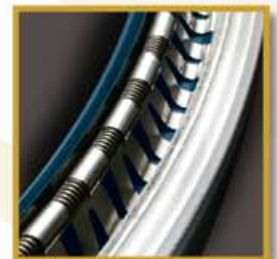
MILL-RIGHT® ES (HNBR) BLUE