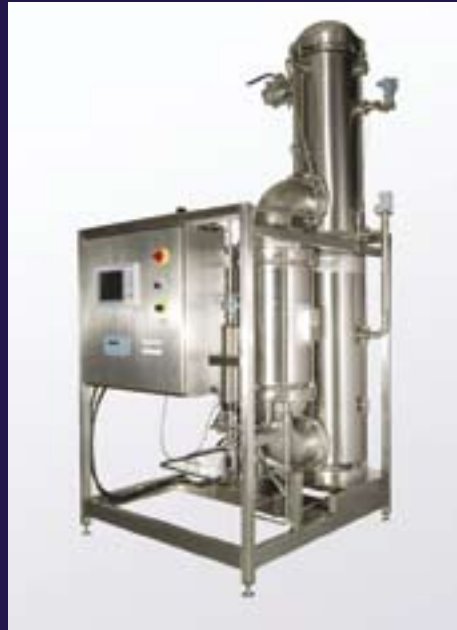
Clean and pure steam generators