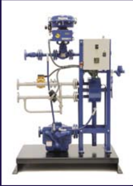
Compact standard heat exchange packages