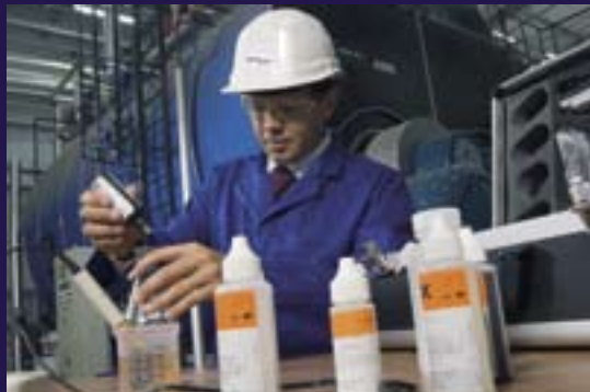
Steam condition monitoring