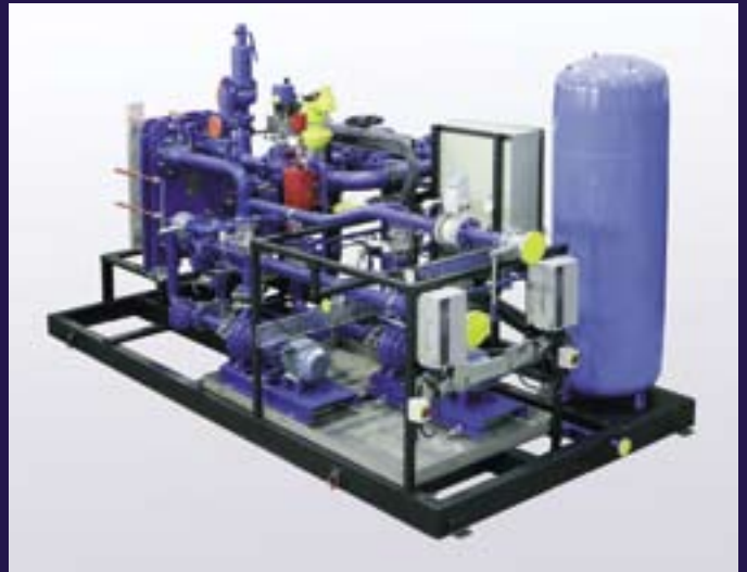
Bespoke engineered systems