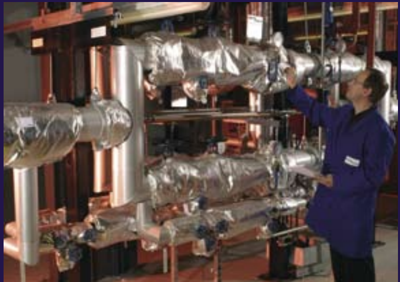
Ready assembled control systems