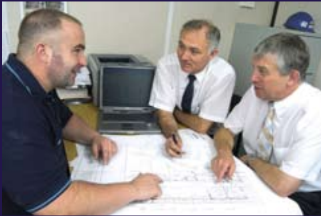
Customer focused solutions partner