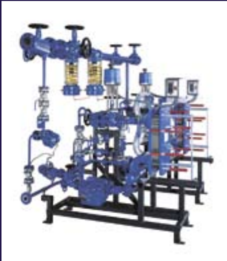
Specially designed heat exchange solutions